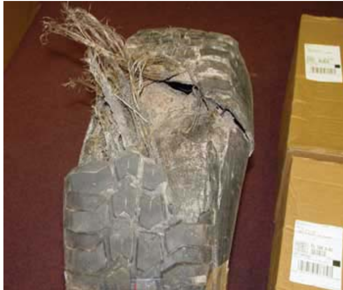
Photo. Right front tire after blow-out.