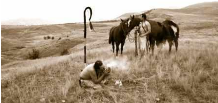
Salish Fire Starters Depicted in Fire on the Land DVD.

As Salish and Pend d'Oreille people, our view of fire was and is quite different from the modern western view. In our tradition, fire is a gift from the Creator brought to us by the animals. We think of it as a blessing that if used respectfully and in a manner consistent with our traditional knowledge, will enrich our world. This belief explains our long tradition (12,000 plus years) of spring and fall burning and of adapting to, rather than fighting against, lightning-caused fires.