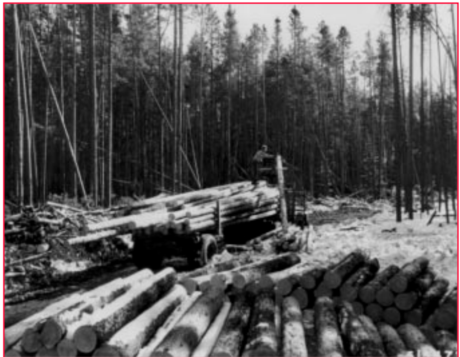
Logs being loaded for power and telephone poles, Routt National Forest, CO. After World War II, large clearcuts were seen as the answer to fuel management problems. However, extensive clearcutting fed public dissatisfaction with harvesting practices and did little to prevent severe fires.

Government foresters did not realize that, without fire as a thinning agent, too many small trees would spring up and create problems. Selective harvesting removed large, fire-resistant trees and allowed small trees to proliferate.