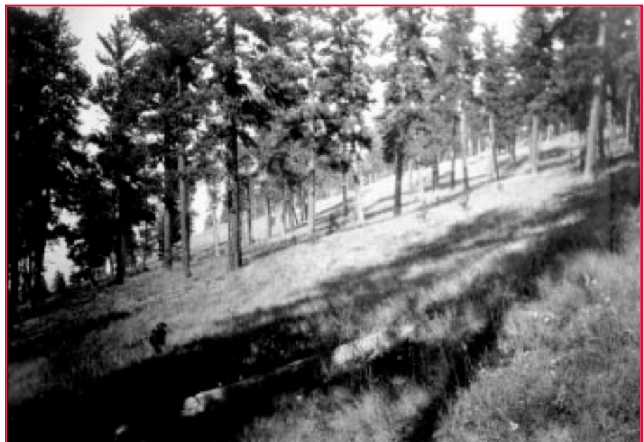
Figure 1 —Ponderosa pine forest near Seeley Lake in western Montana in 1899, before logging and fire suppression. Frequent understory fires kept most ponderosa pine stands relatively open, with few understory trees and only small quantities of surface fuel. Photo: H. Ayres, USDI U.S. Geological Survey, 1899.