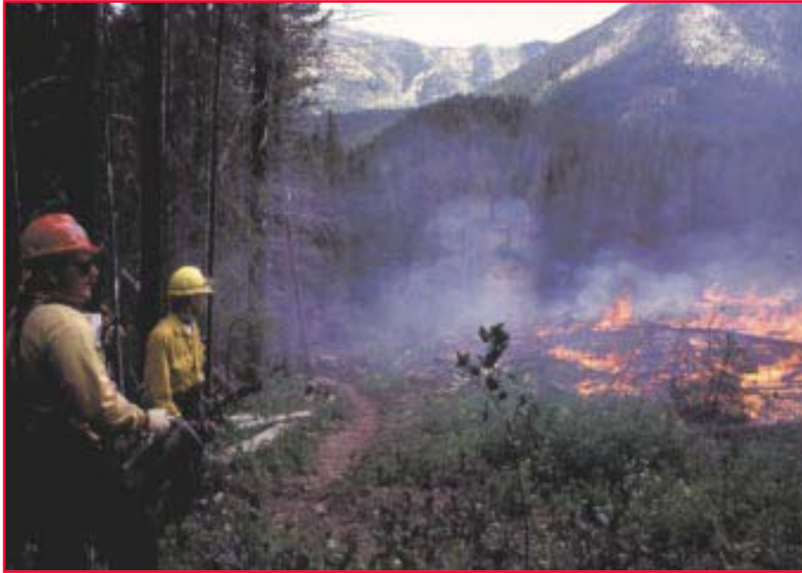
Prescribed fire, Lewis and Clark National Forest, MT. In recent years, the Federal Government has supported a great expansion of fuels management and fire use in western forests. However, much more will be needed.

challenging, and require considerable public support, to achieve fire management goals. In contrast, it will be easy to escalate suppression efforts, even though the corresponding increases in spending might be largely ineffective.