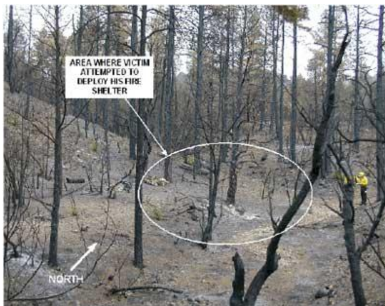
Photo 2. View of deployment area looking up drainage.