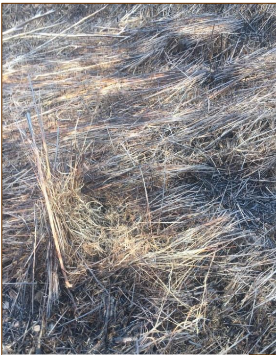
2017 partially burned cheatgrass

On July 24, 2017 at approximately 1700, winds pushed the Preacher Fire past containment efforts. As a result, the escape route for a crew lookout was compromised, forcing him to retreat from the fire through unburned fuels. The lookout lit a fire to create a safety zone, which aided a Type I helicopter to quickly locate him.