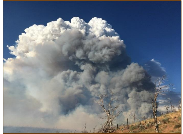
Convective column from fuel-driven fire behavior