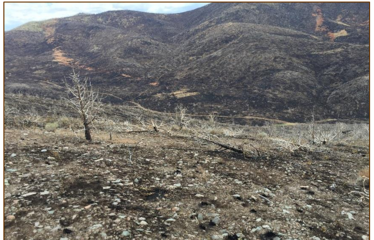
Example of the lookout's perspective on the Preacher Fire

As a final note, when a firefighter is exposed to heat and smoke, it is essential that all supervisors, module leaders and firefighters are familiar with the "Required Treatment for Burn Injuries," located on page 171 of the Red Book.