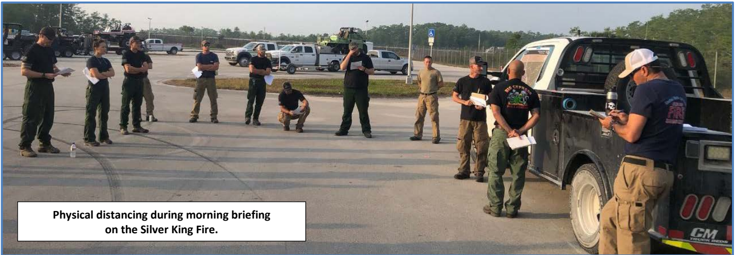
Physical distancing during morning briefing on the Silver King Fire.