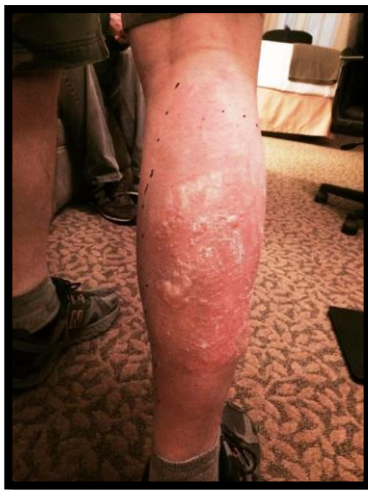
Day of burn injury

Firefighters have reported multiple burn injuries involving drip torches and several more from accidental fuel ignition in the last several years. The Flammable Liquid Ignitions article, found at the Wildland Fire Lessons Learned Center , has links to 14 fuel ignition incident reports. These accidents happen to all types of firefighters with varying levels of fire experience from all regions of the country.