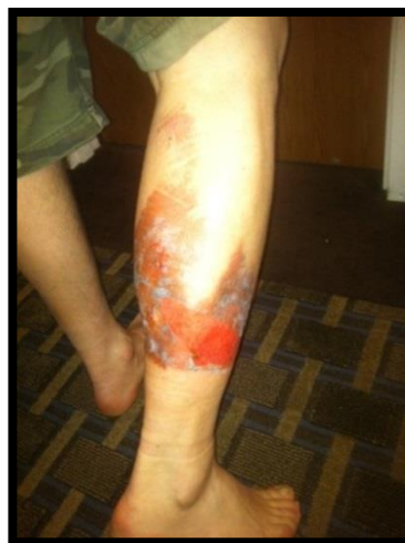
5 Days after burn injury