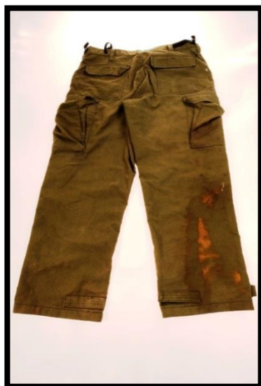
Pants worn by individual above during burn injury incident